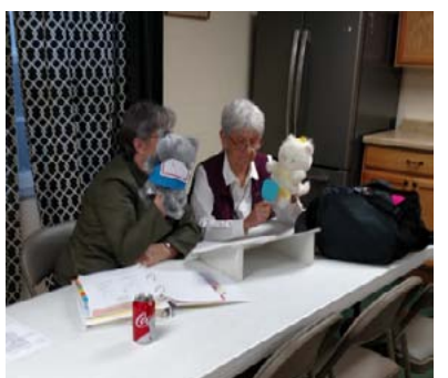
Pictures from the BABES Volunteer Training in January. Thanks to all!